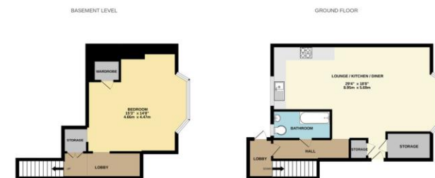
While every attempt has been made to ensure the accuracy of the floorplan contained herein, measurements of floors, windows, rooms and any other areas are approximate and are not intended to be used for any legal purposes or as a substitute for a professional survey. The seller, vendor and agent accept no liability for any errors or omissions. Made with Metaplan 10/2022

Term: 964 years (approx.) remaining Ground rent & Service charge: £100 pcm (max)