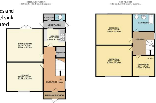
TOTAL FLOOR AREA: 938 sq.ft. (87.0 sq.m.) approx. When areas are given they are meant to assist the accuracy of the floor plan. Measurements are given in feet and inches and in metres and centimetres. Measurements are given to the nearest millimetre. The floor area is not intended to be used for legal purposes. The floor area is not intended to be used for legal purposes. The floor area is not intended to be used for legal purposes.

REAR Slabbed patio area, lawned area and gated access to the front.