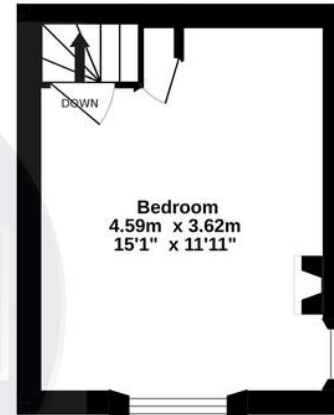
1st Floor 16.4 sq.m. (176 sq.ft.) approx.

Whilst every attempt has been made to ensure the accuracy of the floorplan contained here, measurements of doors, windows, rooms and any other items are approximate and no responsibility is taken for any error, omission or mis-statement. This plan is for illustrative purposes only and should be used as such by any prospective purchaser. The services, systems and appliances shown have not been tested and no guarantee as to their operability or efficiency can be given. Made with Metropix ©2023